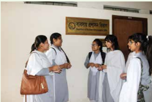
Students in front of department

Guardians (only ID card holders) are allowed to meet with the students during class hours only