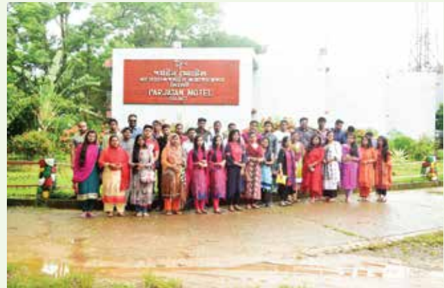
Study tour 2018- Shylet