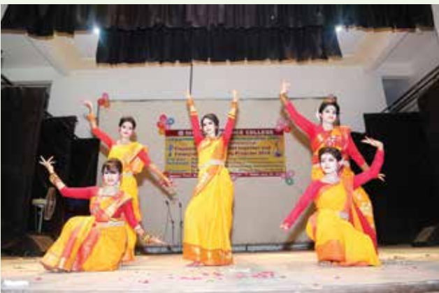
Dance being performed by the BBA students.

Views exchanging meetings among students, guardians and teachers are held on a date fixed by college/departmental authority or after the exams. It is a must for the guardians to be present there. Infact an examinee's progress in study or overall development depends on the united efforts of the students, teachers and guardians. In this way the students can make good results.