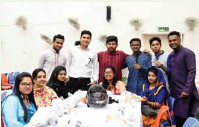
BBA students participating in Iftar Mahfil

The college has no students' council. But there is a students' welfare council under the supervision