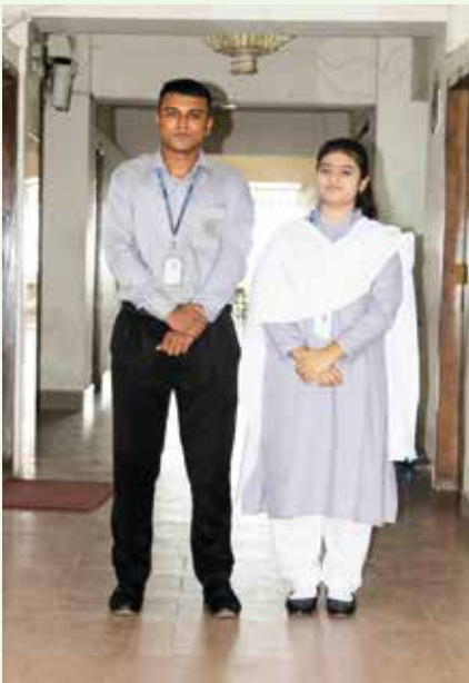
Uniform of BBA Students

All Students should wear the dress and badge determined by the college. Without uniform and after schedule time no student is allowed to enter the college.