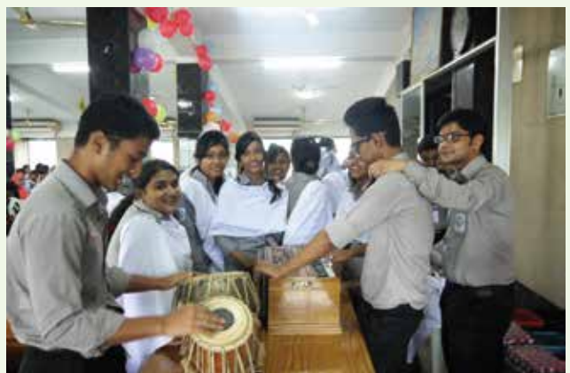
Rehearsal of music by the BBA students

Maximum five days leave of absence in each semester for a student may be granted under special circumstances for the application of the real/original guardian. However, such leave may not be granted in case of examination.