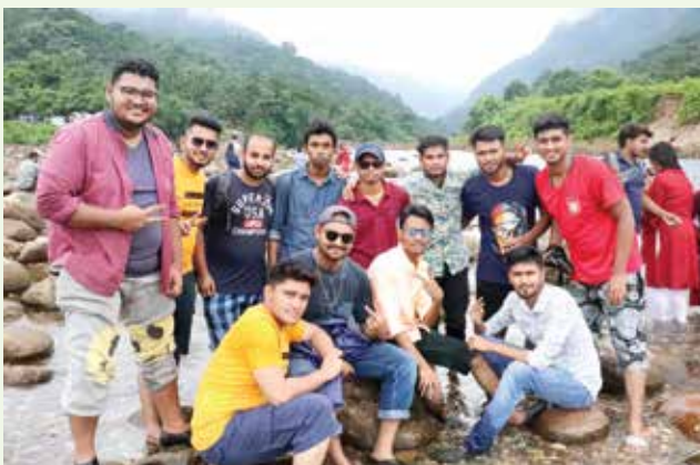
Study tour 2018- Bichanakandi, Shylet