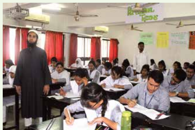
Students of BBA Program are in the Exam Hall.

The academic and administrative matters of the students of the program are looked after by the