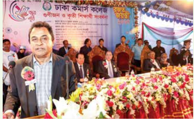
Planning Minister Mr. A H M Mustafa Kamal is delivering his speech as chief guest of 25 years anniversary celebration of Dhaka Commerce College

Management education is critical of the process of socio-economic development of a developing country like ours. The need for competent managers required to run an organization effectively is increasing day by day throughout the whole world. To mitigate this need, Dhaka Commerce College launched BBA Program in 1997-98 session. In the mean time, the students have achieved outstanding results in Board and University exams. The college received the best college award from the Government in 1996 and in 2002.