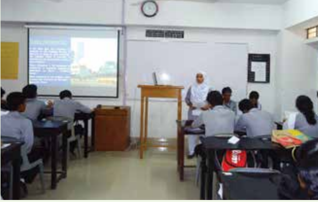
Student delivering presentation