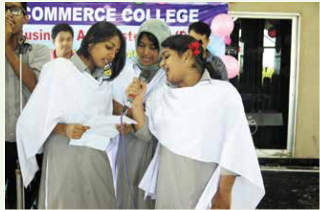
Group performance in cultural program

Any indecorous activity subversive of students is strictly prohibited while in uniform. Anybody involved in such activity must be turned out of the college on discipline ground.