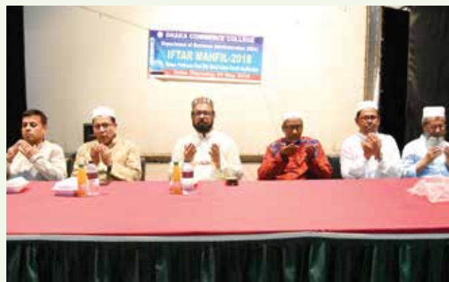
On the program of Iftar Mahfil-2018, organized by Department of BBA Students

There are clubs for general knowledge, debate, Voice of America (VOA) fan, recitation, drama, music, cycling and skating, table tennis, Red Crescent, Rotaract etc. Students flourish their potentiality being the members of these clubs of their own accord. Besides, the B.N.C.C. is functioning as well.