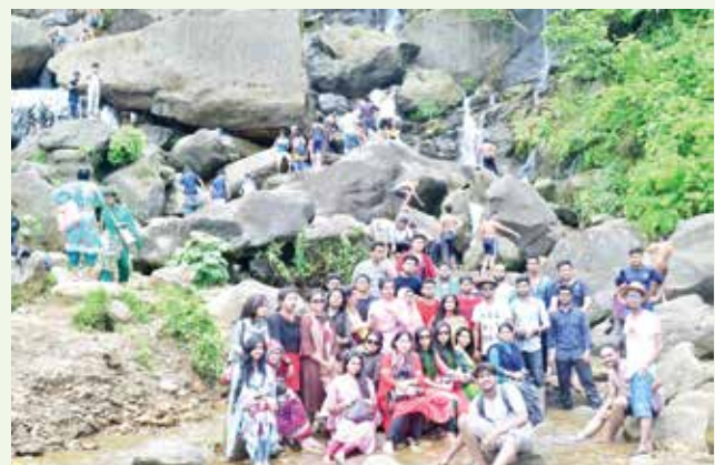
Study tour 2018- Shylet

with the prior permission of the authority. Such permission is given in case of emergency.