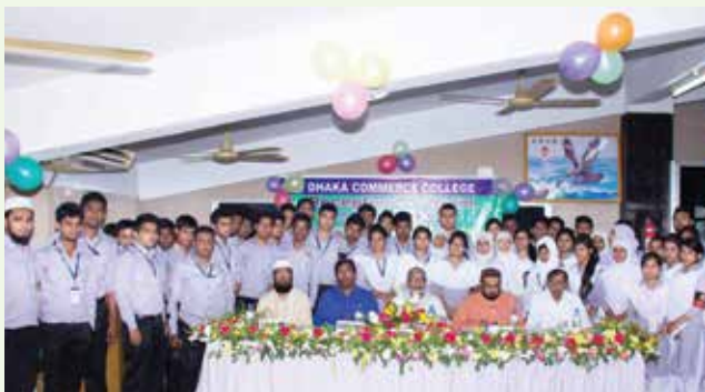
Reception program of BBA students