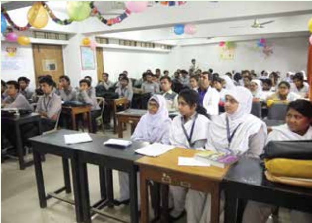
Evaluation of students' prestation