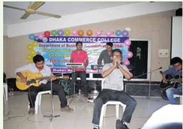
Music being performed by the BBA students

After collecting papers from accounts section of the college, semester tuition fees and other fees should be deposited in the collection centre of Social Islami Bank Ltd. at college premises on fixed date and time. Receipts of paying fees must be shown to the office of the college.