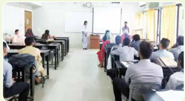
Students Presentation Program

A student earning D or more can opt for appearing in the Improvement Examination (except for Viva and Project Paper Defense) with next immediate available batch only, but only once for one course. In that case the earlier grade (and also the relevant marks, if any) earned in the course will be deleted. All midterm and assignment marks will remain unchanged in case of a student appearing in any improvement examination (i.e., improvement will depend only on the course final examination). In case of re-admitted students, the marks obtained earlier in the same semester courses only will be deleted from his/her record. However, a student will be usually readmitted in First, Third, Fifth, or Seventh semester only. In both the cases of retaking a course for failure or for improvement, a student must apply in specific form to the Controller of Examinations through the Head of the Department and through the Principal within 15 days of the publication of the provisional result. Semester results or yearly results (if combined for two semesters) will be considered as provisional.