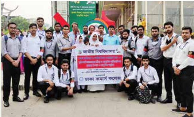
National University Prize Giving Ceremony

We will build the student as a well-educated and self-educated person through discipline, and diligence which will take you to the zenith of success in every sphere of your future life. Our careful nursing will establish a strong foundation of your future life. Your present preparation is indispensable for yourself and for the nation in future.