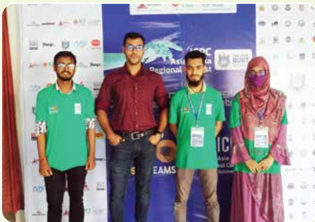
Students Participating in ACM ICPC Asia Dhaka regional contest final

Students will be supplied with books and materials which they will be required to read and understand. To develop sound study habits, arrangements are made for supervised reading in the library of the college. Students are required to prepare daily work assignments, participate in class discussions and sit for periodical quizzes and tests. Arrangements will be made to hold lectures and research seminars by prominent business executives or academicians on subjects of current business and research interest.