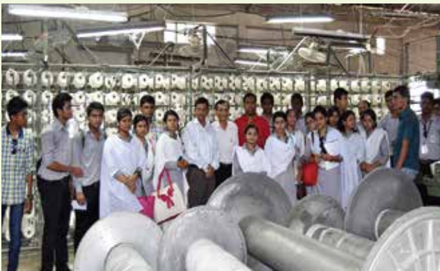
Industry visit: BBA students and Faculty members with the General Manager inside Asian Textile Mills Limited

There are clubs for Debate, Drama, Music, General Knowledge, Recitation, Rotaract, Readers & Writers, Language, Art & Photography, Dance, Nature Study, Business, Film, IT, Social Welfare & Science. Students flourish their potentiality being the members of these clubs of their own accord. Besides, the BNCC, Red Crescent Youth Team & Scouts are functioning as well.