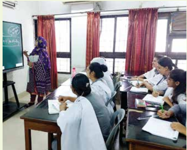
Class being conducted using Digital Board

Guardians (only ID card holders) are allowed to meet with the students during class hours only with the prior permission of the authority. Such permission is given in case of emergency.