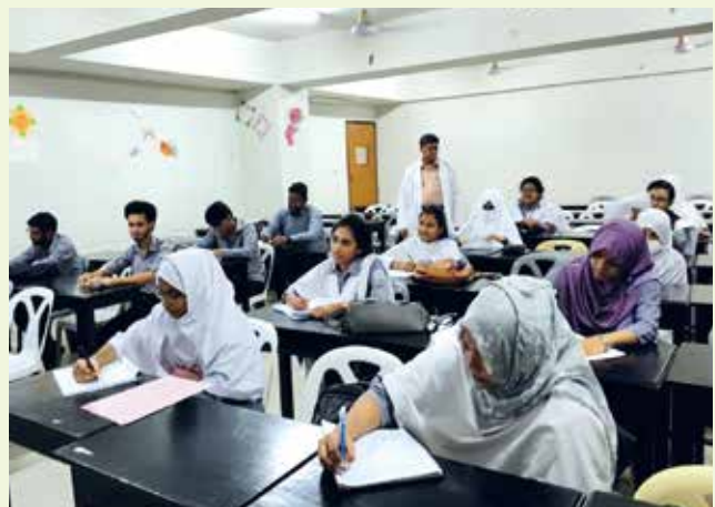
Students of CSE program are in the Exam Hall