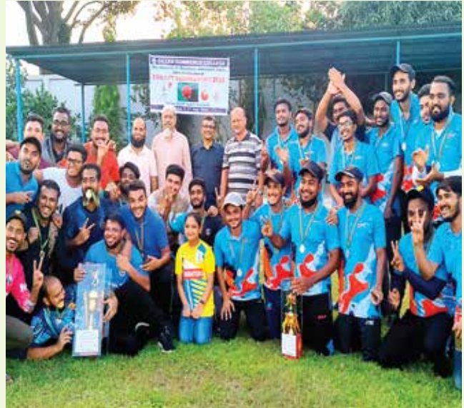
Inter Batch Cricket Tournament arranged by BBA Department

With a view to creating competitive mentality, competition on debates, sports, literary and cultural activities and on cleanliness are held among the students on the basis of section and class.