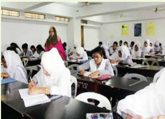
Students of BBA program are in the Exam Hall

Midterm examinations, tutorials, class tests, quizzes are held regularly with a view to flourishing their talent and for internal evaluation. Besides, students have to participate in case studies, presentations and submit assignment. It is mandatory for the students to take part in the internal examinations. In no way, students are allowed to remain absent from the examinations. Sick-beds are arranged for ailing students for conducting examinations. Admission is cancelled or transfer certificate is given to the students who remain absent from the examination.