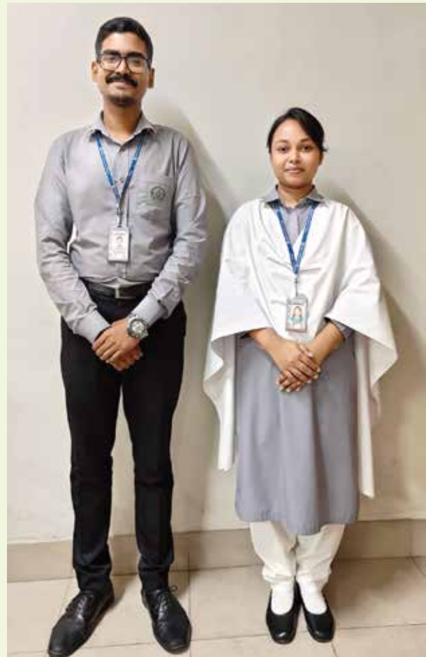
Uniform of the BBA & CSE Students

N.B. To enter the college for other purposes every student should put on college uniform.