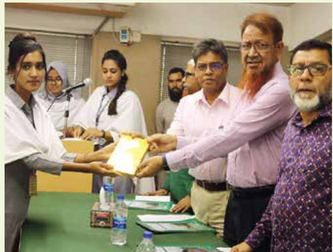
Principal, Vice-Principal and Department Chairman at the farewell ceremony of the first batch