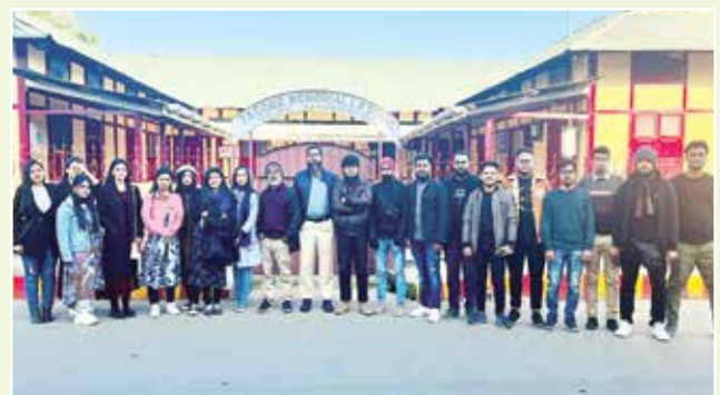
SAARC Tour of BBA Students with Teachers

BBA Professional Program is a four-year program where teaching and examination of allocated courses for a specific semester would be finished within six months. Students will automatically be transferred to the next semester after examination pending the result. The basic structure of the four-years BBA Professional Program is as follows: