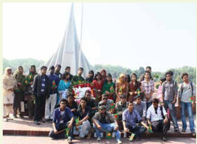
Students visiting National memorial

Even if needed be, the registration in the university may be cancelled. Any recommendation or persuasion about this will be treated as the double crime.