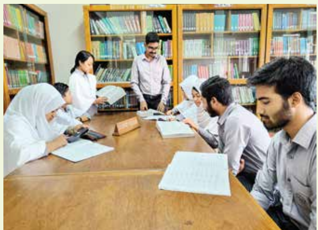
Students' group study in seminar

For the flourishing of leadership quality, students are assigned with various activities of the college and best activist or personality is awarded.