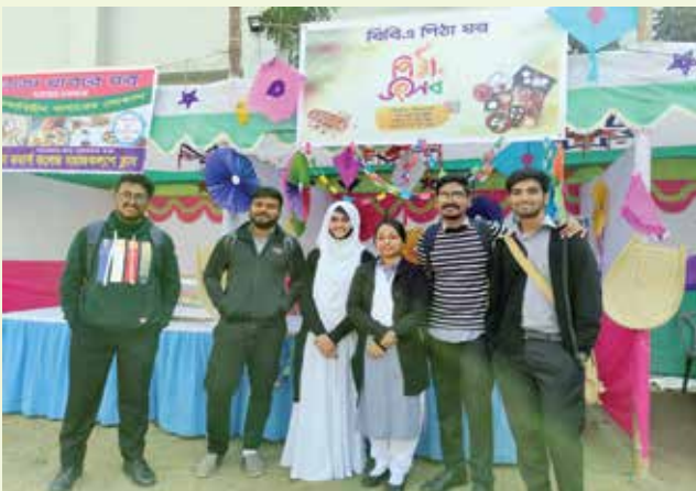
BBA students participated in Pitha Utsab

Extra-curricular activities like sports, literary and cultural program, publishing monthly, yearly and wall-magazine, conducting seminar and debate on various national and religious days, and picnic on different spots are arranged for the physical, mental and spiritual development of the students.