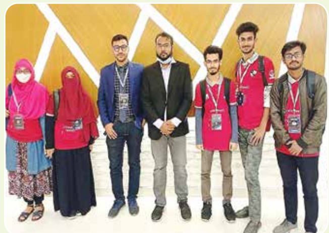
National University Affiliated Colleges "Program Contest" at Tejgaon College