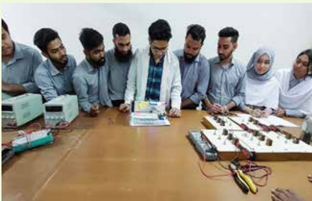
CSE EEC Lab

Our hardware lab has all the required equipment for practicing the hardware related courses. Students can learn by using them directly and practicing more. Our software lab has latest computers that support every software related to the course and also for extra learning. Students can even use the computer lab after class for more practice.